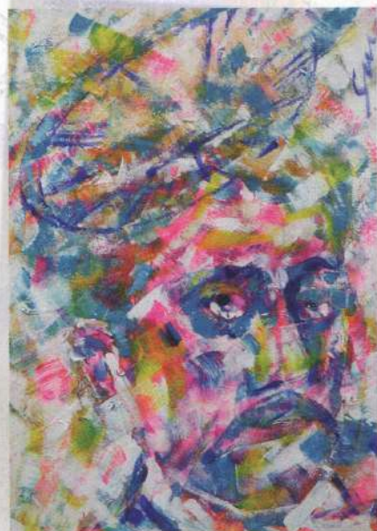
Remembrance - 2017 Theme - Mon Ivresse de la France Acrylic on canvas - 60 x 45 cms