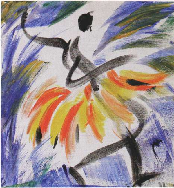
Moves of Josephine - 2015 Theme - Colour of Dance Acrylic on canvas - 41 x 41 cms