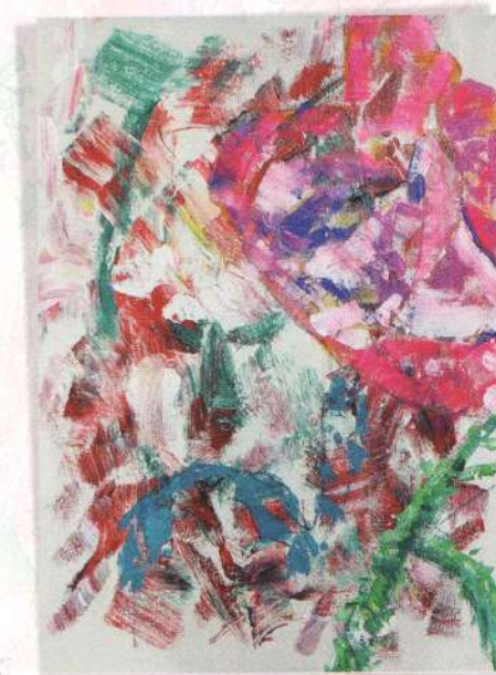
Thorny Love- 2017 Theme - Mon Ivresse de la France Acrylic on canvas - 60x45 cms