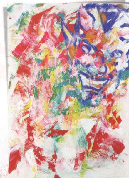
Devil's Time - 2017 Theme - Mon Ivresse de la France Acrylic on canvas - 60x45 cms