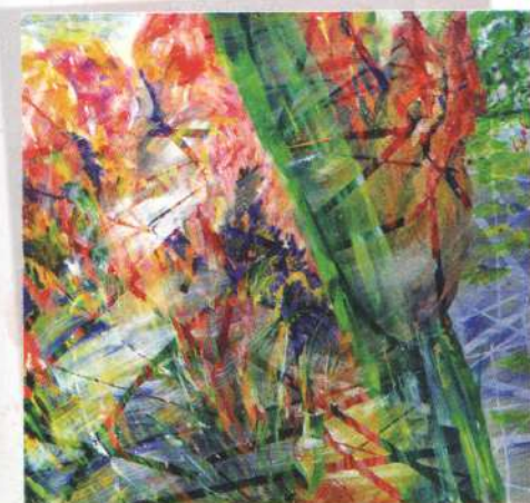
Opium of Giverny - 2015 Theme - Brathing France Acrylic on canvas - 117x107 cms

movements, you can see varied forms of abstract art from one to the other. If you can find the logical link of the canvas slabs following Sen's brush strokes and colours, you will see some hidden figurative message emerge which is the original theme of the installation. Collectors can even regularly change the placement of each canvas to see the same painting in different perspectives.