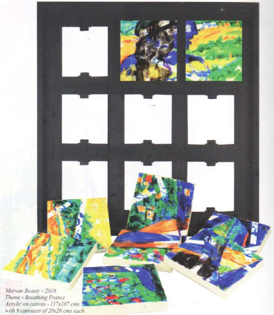
Morvan Beauty - 2016 Theme - Breathing France Acrylic on canvas - 117x107 cms with 9 canvases of 20x20 cms each

has no dogma, no absolute good and bad. Differences of religion, language, food, culture and way of living and dressing radically change almost every 500 kms among India's 1.3 billion population. Unlike in the very Cartesian Western culture, everybody in India has the freedom to use any colour for any occasion. This results in Indian colours being seen to be irreverent. Sen has adopted these irreverent Indian colours which rule over his art.