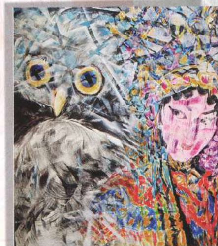
Ferociously Brave- 2016 Theme - Night Spirit Acrylic on canvas - 117x107 cms