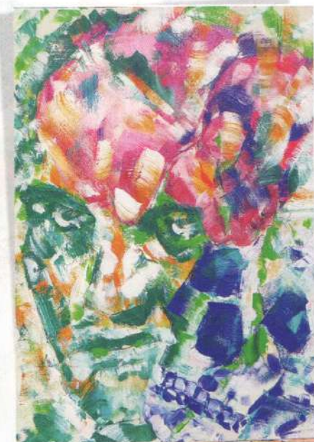
Evil Blossom- 2017 Theme - Mon Ivresse de la France Acrylic on canvas - 60x45 cms